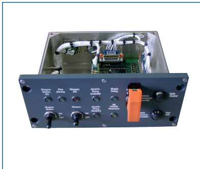
type number 00863