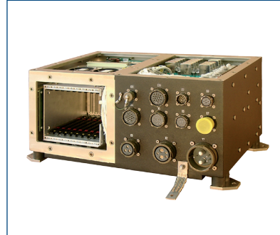
type number 00798