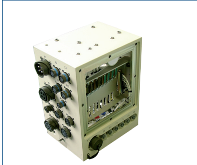
type number 00851

type numbers: 00851 | 00798 | 00863 | 00852 | 00251