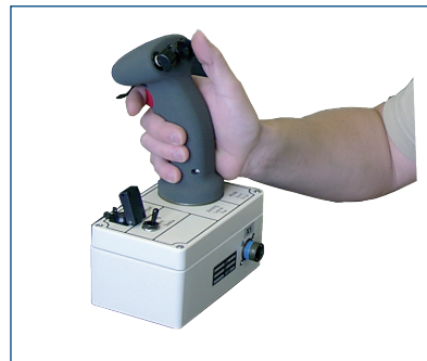
type number 00852